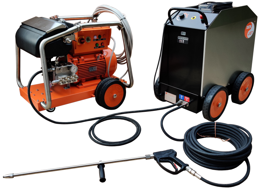
HOT BOX with CE20-500 and dry shut gun 500bar