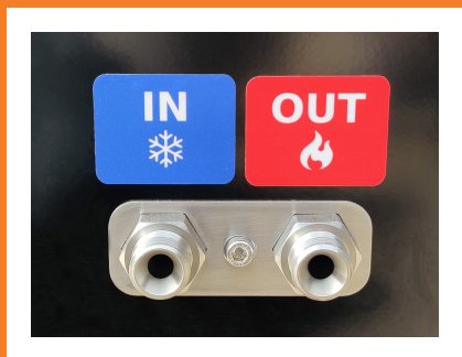
Inlet and Outlet 3 / 8 " BSPP