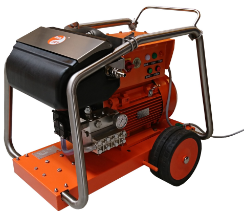
CE 20 Series