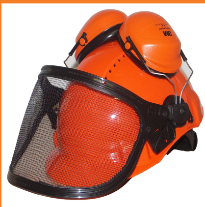
Safety helmet complete