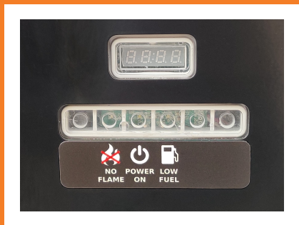
LED display and working hours