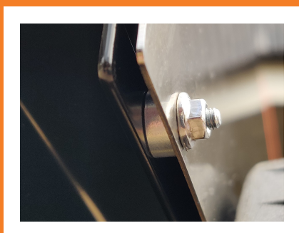
Magnets for easy side access