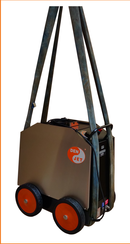
Lifting hot box