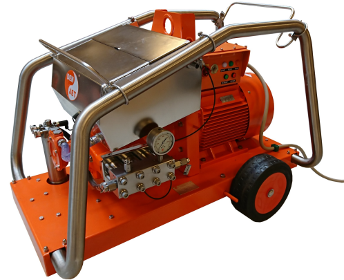
CE 40 Series